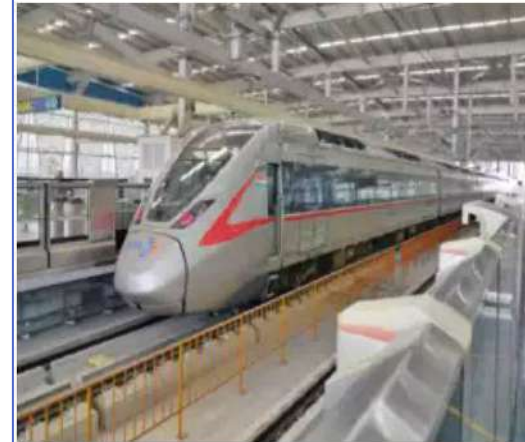
Delhi Meerut rapid rail

The Namo Bharat rapid rail corridor is likely to be extended from Sahibabad to Meerut South by the end of this month, enhancing connectivity between Ghaziabad and Meerut. Approved by the Commissioner of Metro Rail Safety, this 8km extension will cut travel time to 30 minutes. The project includes 13 Meerut stations, with substantial benefits for students and commuters, promising a significant upgrade in travel efficiency.