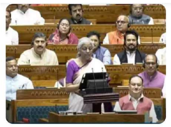
The budget estimates for the ministry of tourism in the budget for 2024-25 is INR 2484.89 crore.

to the budget estimates of the previous financial year, at INR 2400 crore. The revised estimate for tourism was INR 1697 crore.